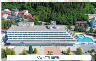
SPA HOTEL KRYM