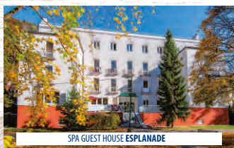
SPA GUEST HOUSE ESPLANADE