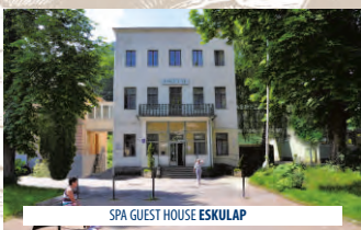
SPA GUEST HOUSE ESKULAP