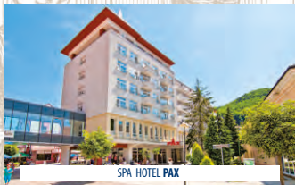
SPA HOTEL PAX