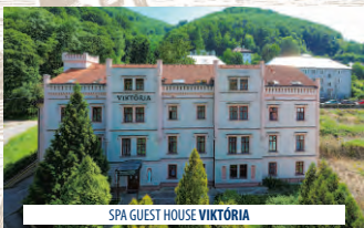
SPA GUEST HOUSE VIKTÓRIA