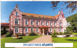
SPA GUEST HOUSE ATLANTIS