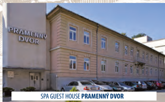
SPA GUEST HOUSE PRAMENNÝ DVŮR